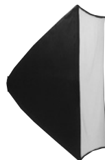
53.408.00 Soloflex 80 80 x 80 cm (32 x 32")