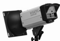
51.040.00 LOGOS 800 200-240 V/50 Hz bi-voltage