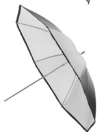
53.450.00 Umbrella, white