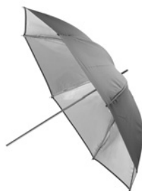
53.452.00 Umbrella, silver