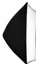
53.417.00 Soloflex 60 x 90 60 x 90 cm (24 x 35")