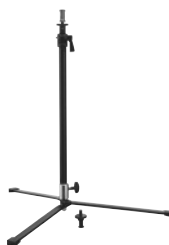
55.102.00 Floor stand