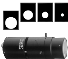
53.130.00 Projection attachment Solospot 800 B/1600 B with flash tube, protecting glass, gobo holder and masks