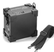
56.302.00 Powerbox 900