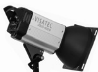
51.130.00 SOLO 400 B 120 V/60 Hz

All monoblocs with protecting glass and grey protection cap