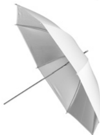
53.453.00 Umbrella, sun