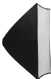
53.409.00 Soloflex 100 100 x 100 cm (40 x 40")