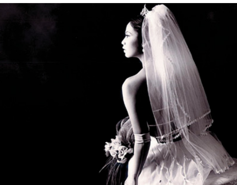
Frida-Orkid Studio, Indonesia

A comprehensive selection of accessories can be exchanged quickly and easily using the VISATEC bayonet mount. All reflectors can be rotated 360°, an advantage especially with barn doors and rectangular reflectors.