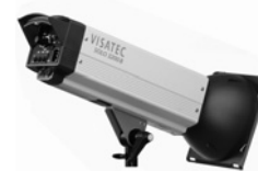
51.104.00 SOLO 3200 B 120 V/60 Hz