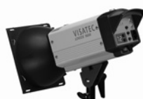
51.050.00 LOGOS 1600 200-240 V/50 Hz bi-voltage