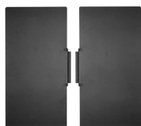
53.221.00 Barn door for softlight reflector