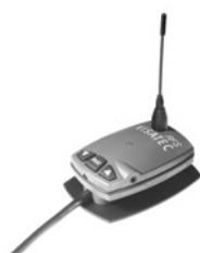
56.202.00 Transceiver RFS