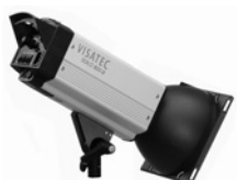
51.010.00 SOLO 800 B 120 V/ 60 Hz