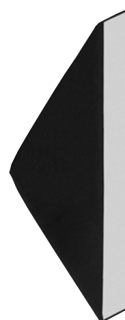
53.416.00 Soloflex 80 x 160 80 x 160 cm (32 x 64")