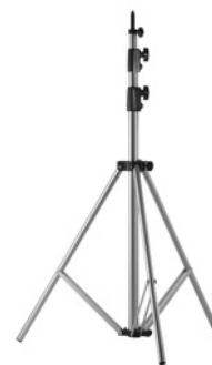
55.103.00 XL stand