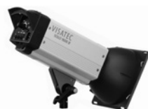
51.102.00 SOLO 1600 B 120 V/60 Hz