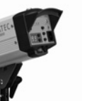
51.042.00 LOGOS 800 RFS 200-240 V/50Hz bi-voltage