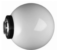
53.122.00 Globo UV coated acrylic glass sphere, ø 30 cm (11.8")