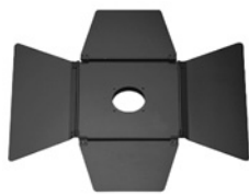
53.121.00 Sunlite attachment