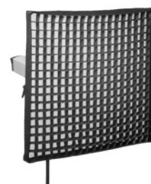
53.202.00 Fabric grid Lighttools TM for Soloflex 80