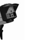
51.052.00 LOGOS 1600 RFS 200-240 V/50 Hz bi-voltage