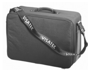
56.503.00 Travel bag empty for VISATEC Kit 108