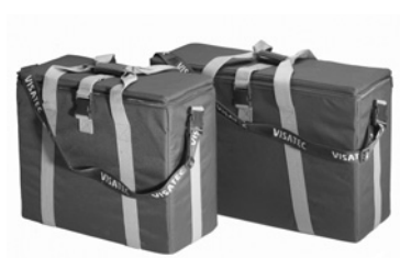
56.506.00 Travel bag empty for VISATEC Kits 204, 208, 216