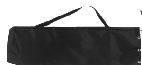
56.550.00 Bag for stands