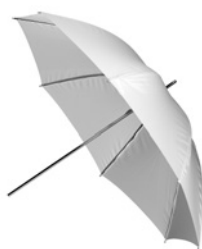
53.451.00 Umbrella, transparent