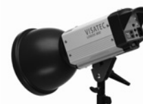
51.070.00 LOGOS 800 BC 200-240 V/50 Hz bi-voltage